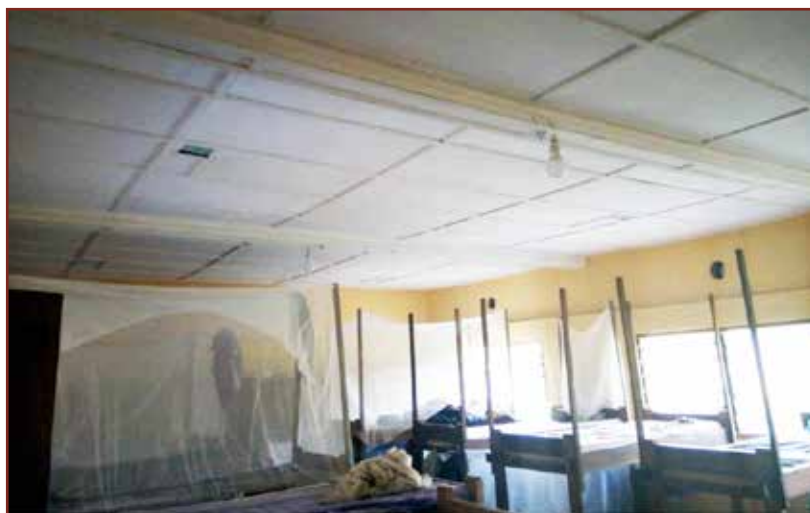
in the boy’s house a new ceiling was installed to fight the heat