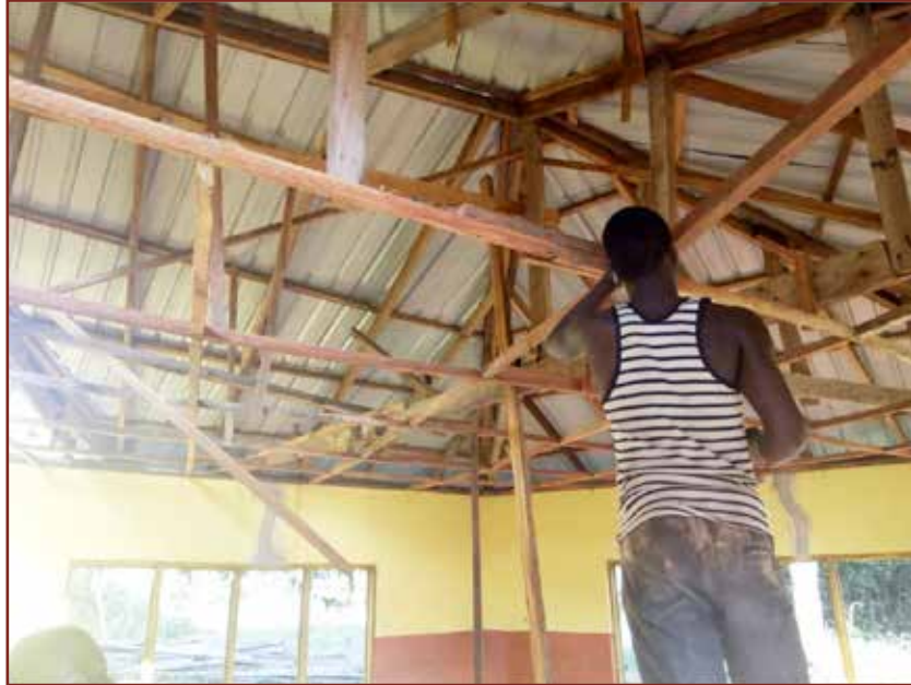
the whole roof truss had to be renewed.