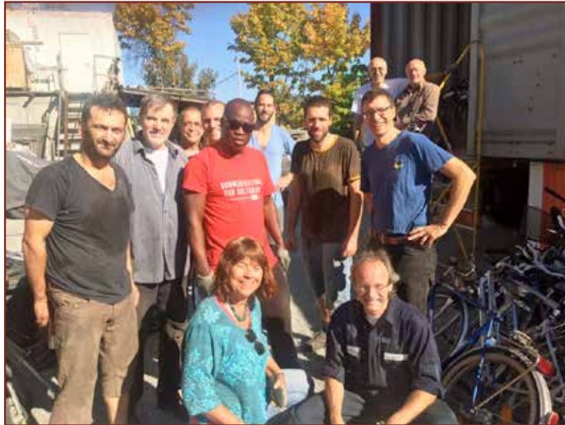
many, many helpers

This year I got the opportunity to be present during the loading up of a container. This was pure Africa! There was blazing sunshine at the Fahrräder für Afrika's village of prefab huts (the containers had to be removed out of the hangars because of some restauration-works) and an unbelievable number of people helped to load the container. Thank you to all diligent collectors and helpers.