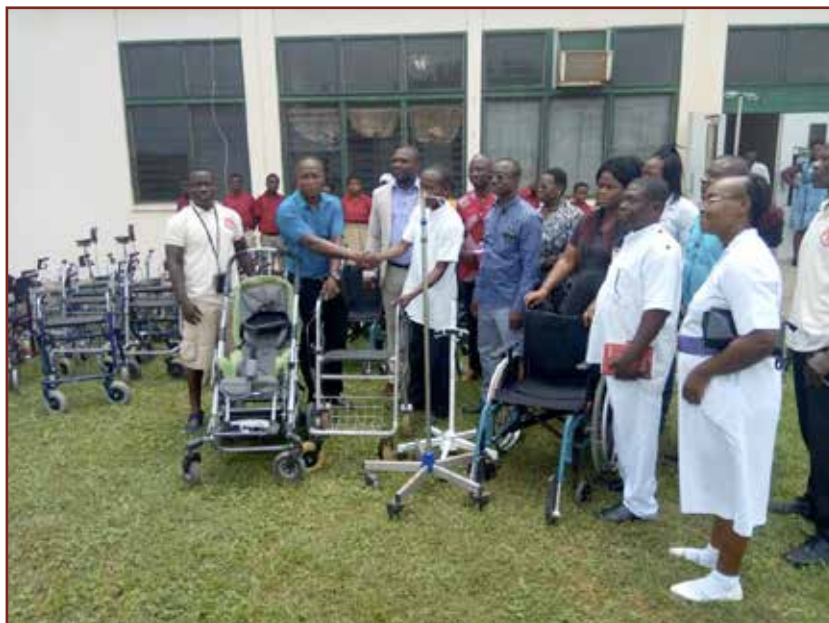
donation of wheel chairs to Central Regional Hospital