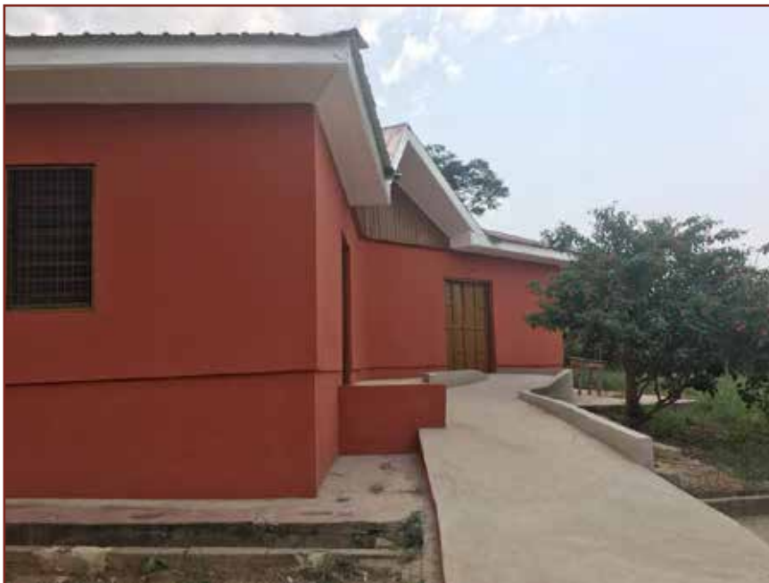
the new old school building