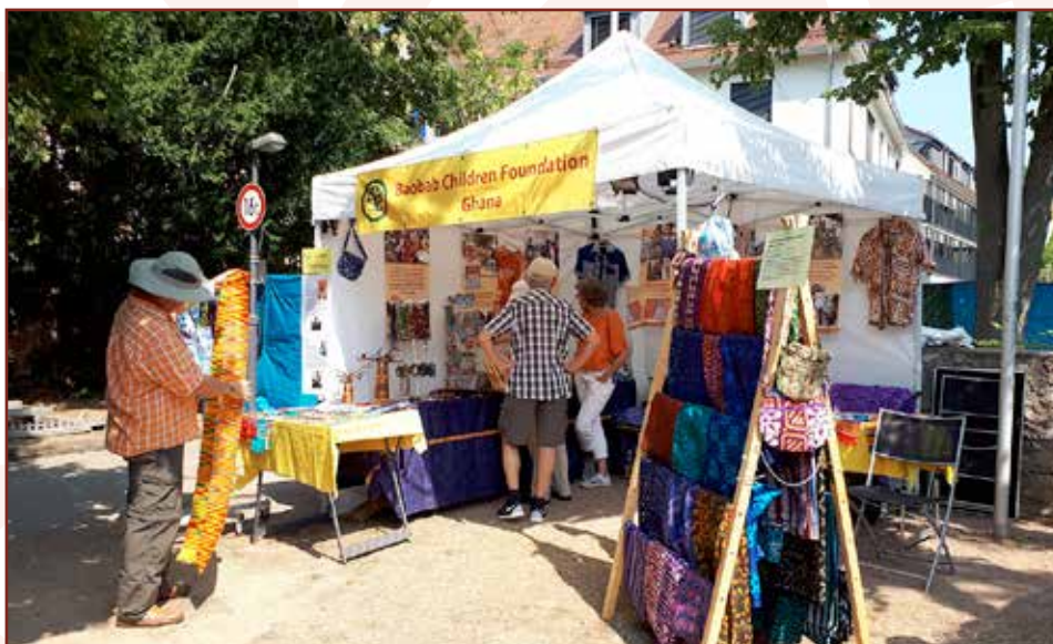
stand in Emmendingen