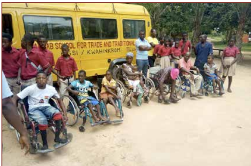
Donation of wheel chairs to the Kissi community